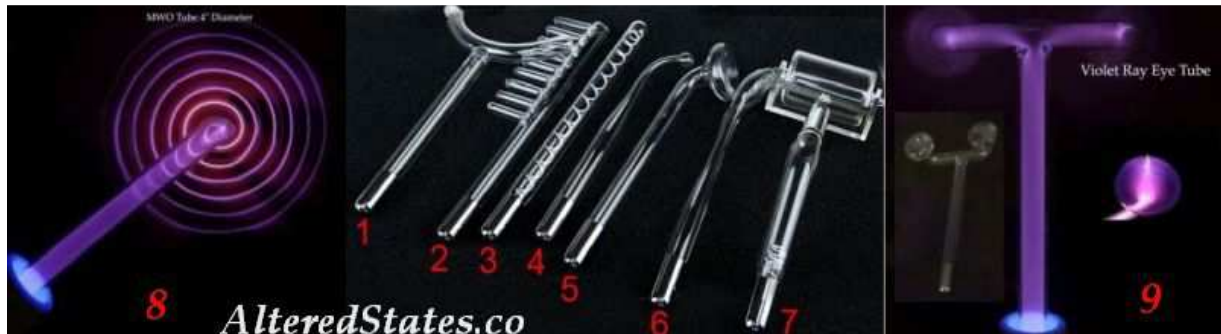
1) Limb 2) Comb 3) Straight 4) Wart or point 5) Mushroom 6) Tongue 7) Roller 8) MWO or large area 9) Eye

Clean and dry the area of the skin that is to be treated. Insert the desired tube carefully into the wand. Be careful not to bend or accidentally drop these glass tubes. They are very delicate and fragile. The tubes are vacuum filled with Argon or Neon gas that will become ineffective if broken from the metal bases.